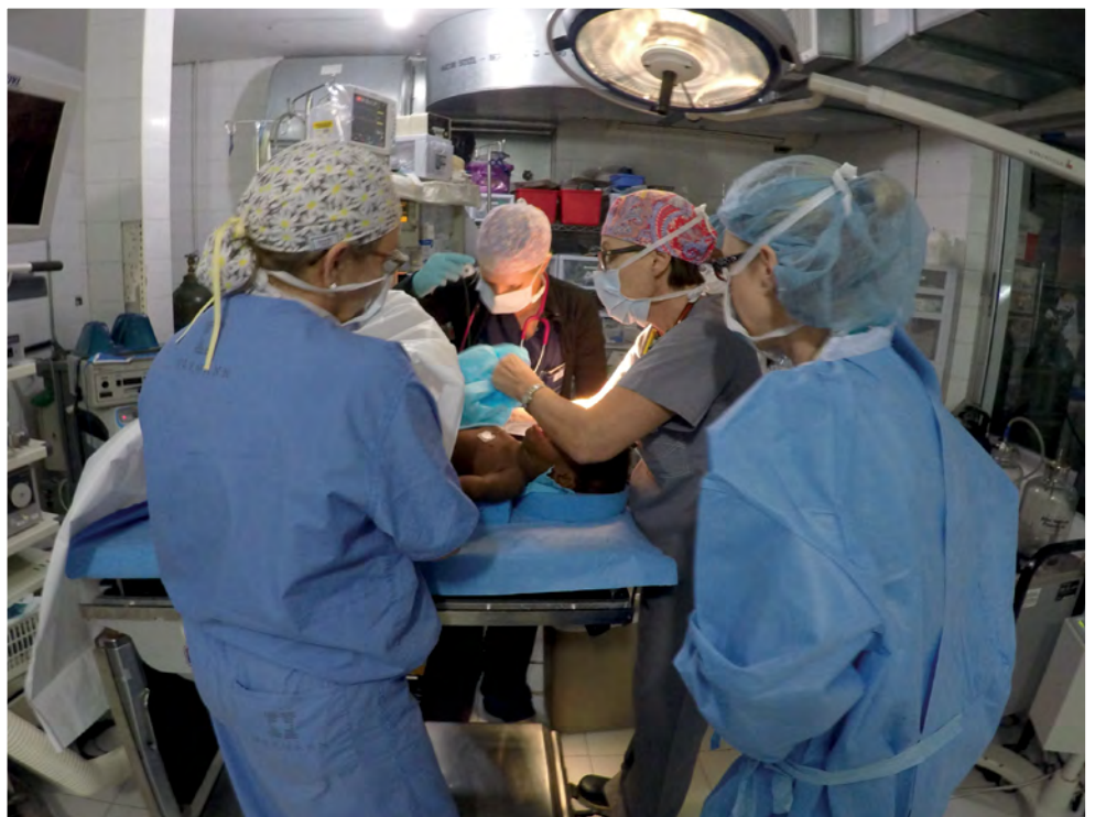
Neurosurgeons, residents and nurses from Memorial Hermann and UTHealth worked closely to treat the pediatric patients with hydrocephalus.

"YOU LEARN VERY QUICKLY ON MISSION TRIPS THAT YOU CAN'T PRACTICE MEDICINE LIKE WE DO IN THE UNITED STATES. RESOURCES ARE LIMITED, AND YOU HAVE TO PITCH IN AND DO WHATEVER NEEDS TO BE DONE."