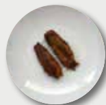
2 medium sardines