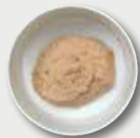
1/3 cup hummus