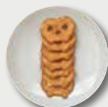
7 pretzel chips