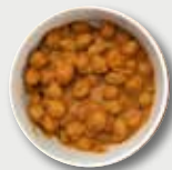
1/2 cup chickpeas curry