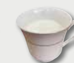
1 cup Buttermilk