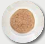
1 6" chapati