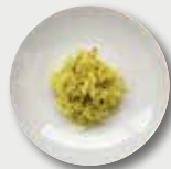
1/2 cup cabbage