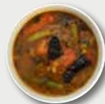
1/2 cup sambar