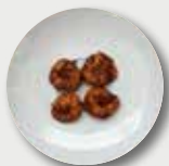
4 large shrimp