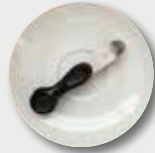
1 tsp canola oil