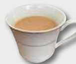
1 cup chai with milk