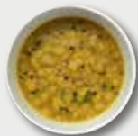
1/2 cup cooked dhal