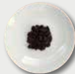
2 Tbsp raisins