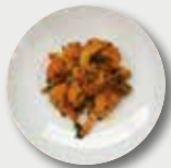
1/2 cup cauliflower