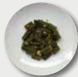
1/2 cup okra