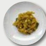
1/2 cup squash