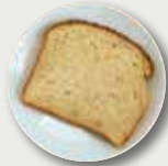
1 slice whole-grain bread