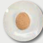
2 Tbsp peanut Chutney