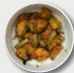
1/3 cup plantain