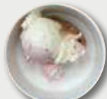
1/2 cup ice cream