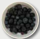
3/4 cup blueberries