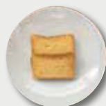
2 rusk crackers