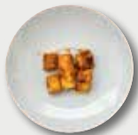
1 oz or 5 small paneer cubed