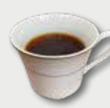
1 cup sugar-free black coffee