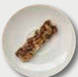
1 granola bar