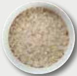
1/2 cup cooked oats