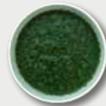
2 Tbsp mint chutney