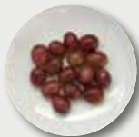
15 to 17 small grapes