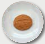
2 Tbsp tomato chutney