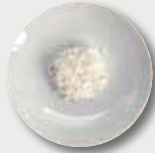
2 Tbsp coconut