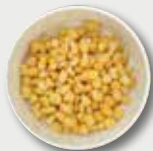
1/2 cup corn