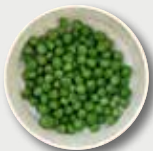
1/2 cup peas