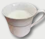
1 cup low-fat Milk