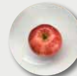
1 2" apple (small)