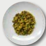
1/2 cup bittermelon