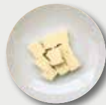
1/2 cup tofu