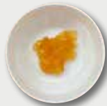
2 tsp sugar-free jam