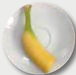
1/2 large banana