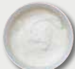
1 cup plain yogurt