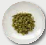
1/2 cup green beans