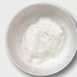
1/3 cup greek yogurt