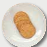
4 Marie™ Biscuits