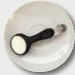
1 Tbsp heavy cream