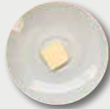
1 tsp butter