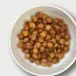
2 Tbsp roasted chickpeas