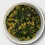
3/4 cup spinach and dhal