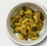
1/2 cup potato sabzi