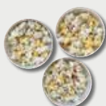
3 cups popcorn