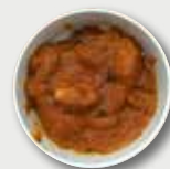
1 oz chicken curry