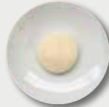
1 3" idli