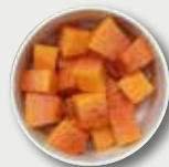
1 cup cubed papaya