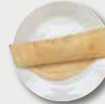
1 10" dosa