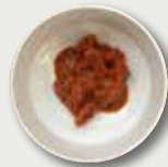
2 Tbsp lemon pickle