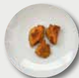
3 1" pieces of chicken tikka