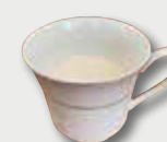
1/2 cup evaporated milk