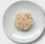
1/3 cup cooked brown rice