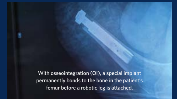
With osseointegration (OI), a special implant permanently bonds to the bone in the patient’s femur before a robotic leg is attached.

LEADING THE WAY IN GAME-CHANGING OI TECHNOLOGY